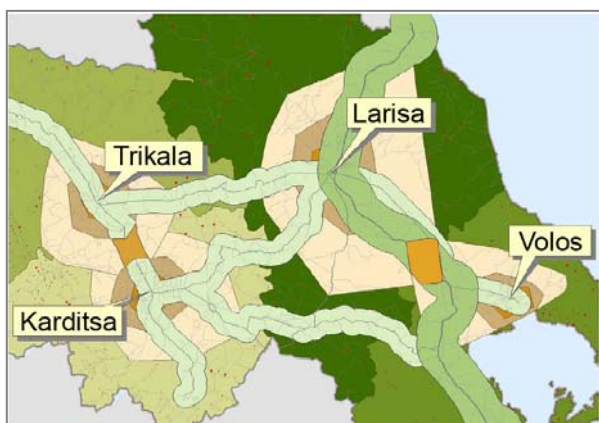
Figure 3: Proposed areas' view.

5) Comparative analysis of the possible solutions, according to the overall transportation, which is defined by the product value of the distance traveled and the population points that were selected from each prefecture. (Figure 3)