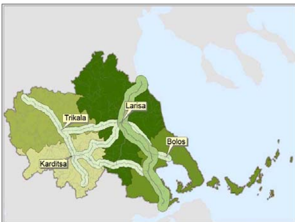
Figure 1: Accessibility zones, in case study area

1) The formulation of accessibility zones, based on the existing road network, depended on the particular type of each road (Figure 1). The range selected was 5 Km on either side of the highways, and 3 Km on the rest of the network.