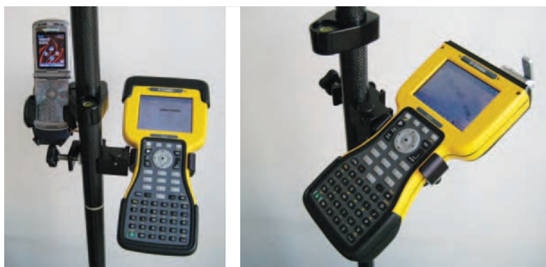
(Left) Figure 2: Bluetooth-connection between a cellular phone with GSM/GPRS modem and an RTK-controller. (Right) Figure 3: A GSM/GPRS CF card installed on an RTK-controller.

For post-processing applications, the user measures in the field using a geodetic receiver (single or dual-frequency) and downloads the necessary reference data from the webserver of HEPOS. This reference data could be from one of the 98 reference stations of the system or from a virtual RS. The sampling interval of the observations can be selected from a list of eight predefined intervals, like 1 second for kinematic applications (e.g. aerial surveys), 15 seconds for rapid-static applications or 60 seconds for high precision geodetic static surveys. The user can also choose to obtain the data in RINEX or CRINEX (compact RINEX) format. The last format saves storage space and is preferable, provided that the office software to be used supports this format. In any case,