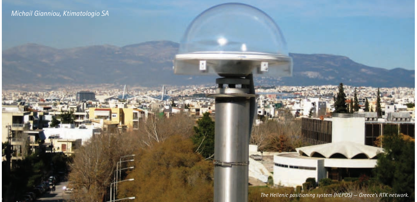
The Hellenic positioning system (HEPOS) – Greece's RTK network.

T HE HELLENIC POSITIONING SYSTEM (HEPOS) is a modern RTK network with nationwide coverage over Greece.