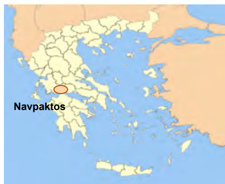
Figure 2: Location of Navpaktos, Hellas (Greece).

Introduction. The first coastal area that has been studied to test the appropriateness of Anthropogenetic Intensity is the coastal area in Navpaktos (greater region between Navpaktos and Antirrhion), Hellas. (Figure 2). It belongs to the prefecture of Aetolia-Akarnania and it is a rather rural region. In this greater region, the following two case studies have been realised: